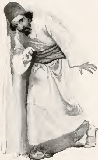
He listened attentively

could hear voices, which seemed to belong to the Robber Chief and the little dark dwarf. He listened attentively, and to his horror heard the little man advising the Chief to murder him, as if he were allowed to go free he might betray the whole troop.